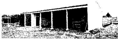
Solar panel roof

Implement shed or workshop will be constructed for equipment and tools storage and farm machinery parking. Total area required for implement shed is 20m (L) x 8m (W), this building requires a very basic structure with solar panel roof on it, floor of the building will be 25Mpa (3626 psi) concrete.